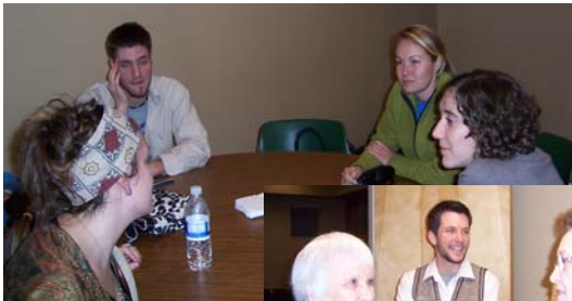
Time for Reflection Together: