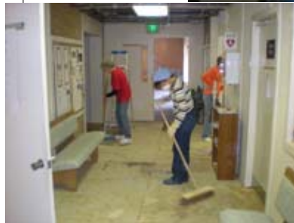
<< Working on restoring First Christian Church, Texas City, TX as a mission station.

During one of the devotions in the first week, the leader asked the question "did you see God move today?" My answer is a most emphatic "YES!" and that is why I enjoy this kind of mission so much. It is such a joy to see people doing things they would never do otherwise and realizing they CAN make a difference in other people's lives. We all have gifts and abilities that God can use. And God has a strange way of putting us into situations where those abilities are useful if we are just open to God's voice.