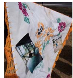
Stories from the desert —told and untold